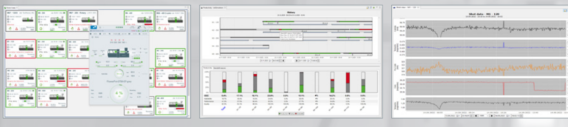
// Plant View and Remote HMI

KePlast EasyNet 4 Professional offers various easy-to-use monitoring and planning functions at a glance, such as the overview of the productivity and the process quality view of an individual machine. Due to the EasyNet HeatUpManagement, you can significantly minimize your energy costs to achieve the best possible machine availability. In the clear overall plant view, the shift manager has an overview of the entire production and can react efficiently to plan production changes or will be informed instantly about machine alarms.