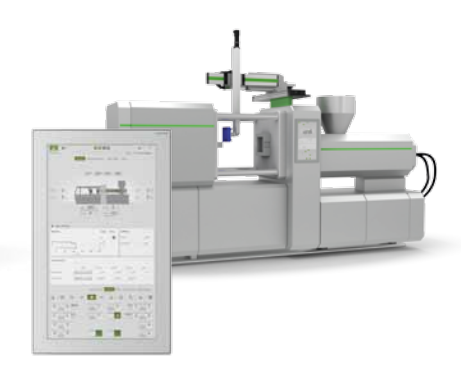
Operation and automation of machines and systems