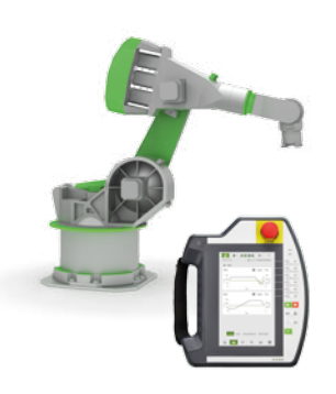
Teaching-in and programming of robots