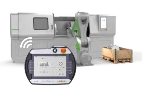
Maintenance work, tests and commissioning