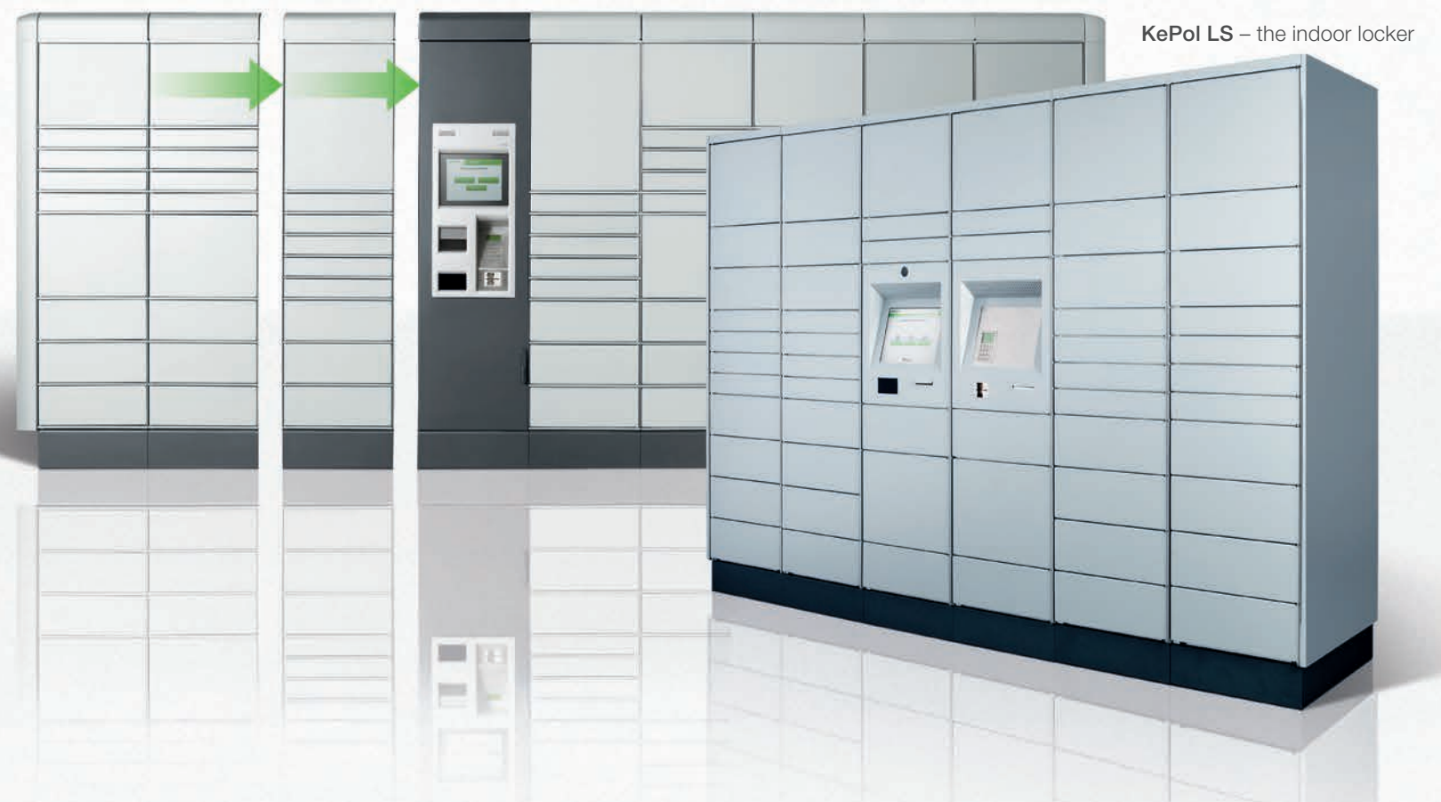
KePol LS – the indoor locker